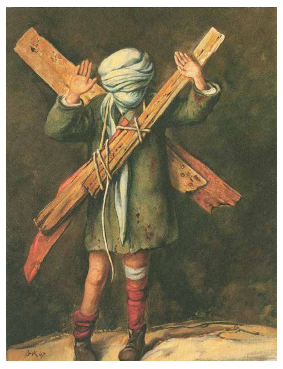
Fig. 4. Samuel Bak, Crossed Out, 2007, oil on canvas. <a href="http://ajwnews.biz/iconic-photo-of-boy-in-warsaw-ghetto-inspires-samuel-bak/(3.2.2020">http://ajwnews.biz/iconic-photo-of-boy-in-warsaw-ghetto-inspires-samuel-bak/(3.2.2020)</a>.