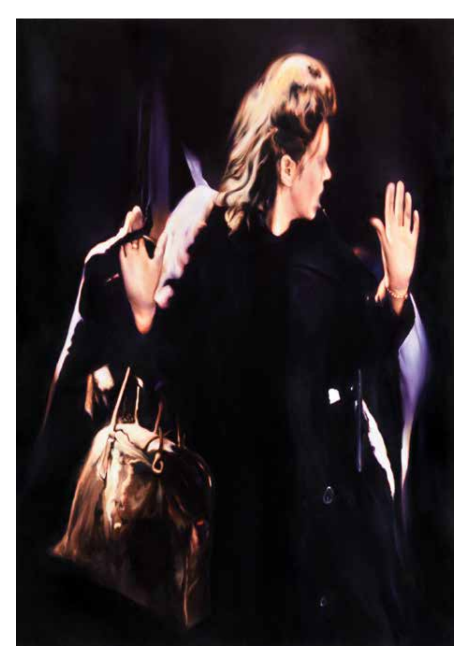
Fig. 5. Nir Hod, Mother, 2012, photograph, paintings (multimedia) – pigment print with hand-colored pastel and pigment powder on paper.