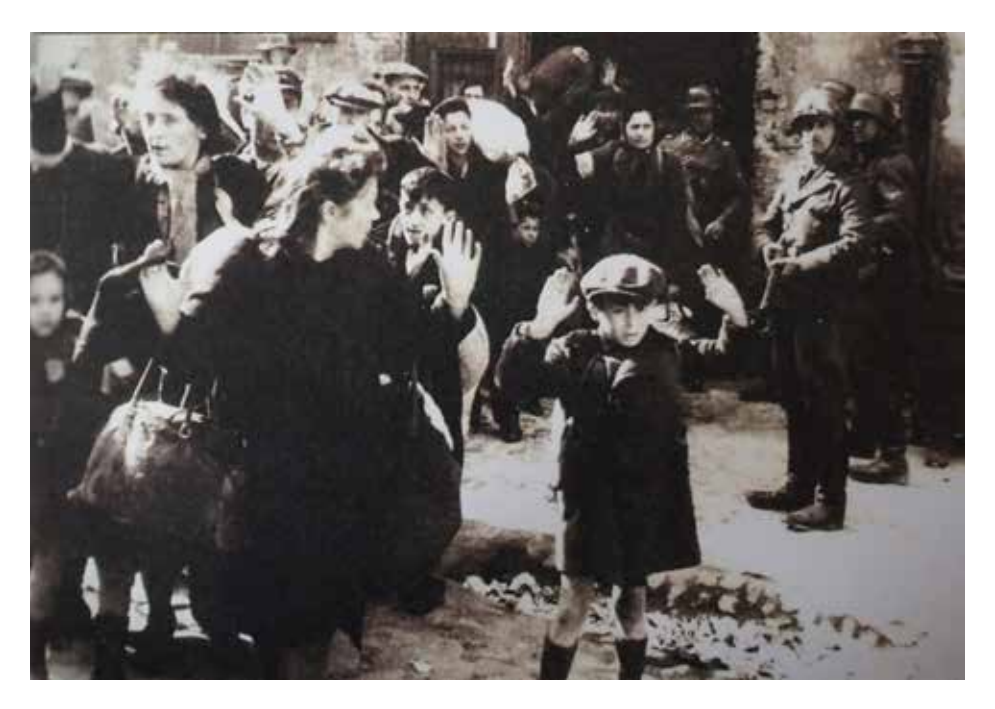
Fig. 2. Photograph Nr 14 from Stroop's Report. – "Bandits pulled out of the bunkers".